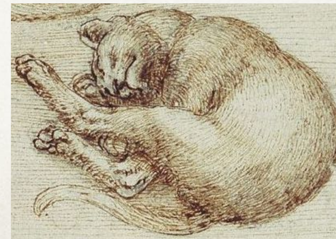
Cat drawing by Leonardo da Vinci, 15th/16th C